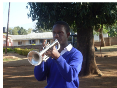
Blowing out a tune for God